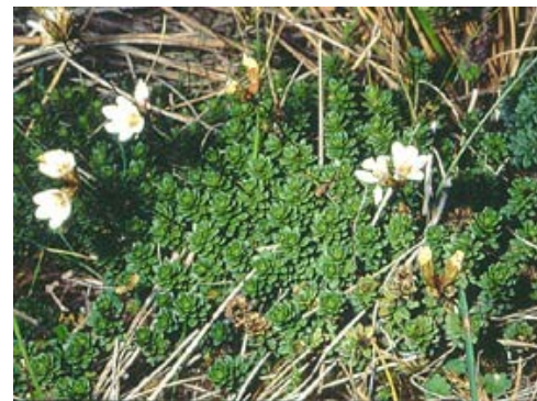
Mt Arthur February.