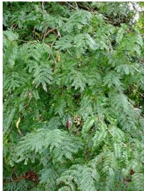
Adult foliage (Planted Tree), St Lukes Road, Mt Albert, Auckland, Mar 2007.