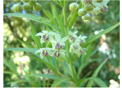
Gomphocarpus fruticosus . Photographer: John Smith-Dodsworth, Licence: CC BY-NC.