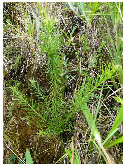
Wild seedling, Whanganui. Photographer: Colin C. Ogle, Date taken: 15/03/2015, Licence: CC BY-NC.