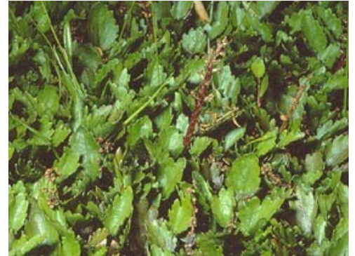
S. Borland flats, January.