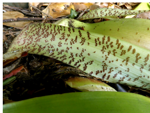
Reddish markings on basal portion of leaf underside; garden, Whanganui. Photographer: Colin C. Ogle, Date taken: 29/11/2016, Licence: CC BY-NC.