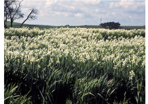
Pasture near Whanganui. Date taken: 01/10/1990, Licence: CC BY-NC.