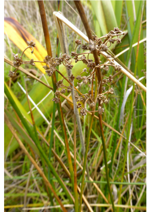
Wet dune-slack, Koitiata, Turakina.