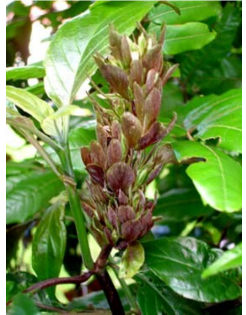
Justicia carnea.