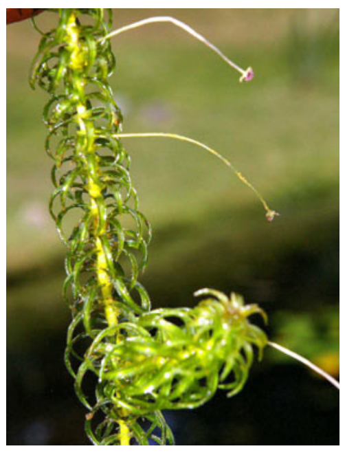
Close up of Lagarosiphon major. Photographer: John Smith-Dodsworth, Licence: CC BY-NC.