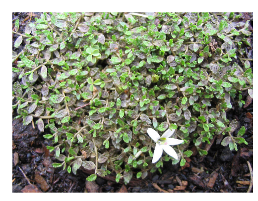
Lobelia perpusilla.