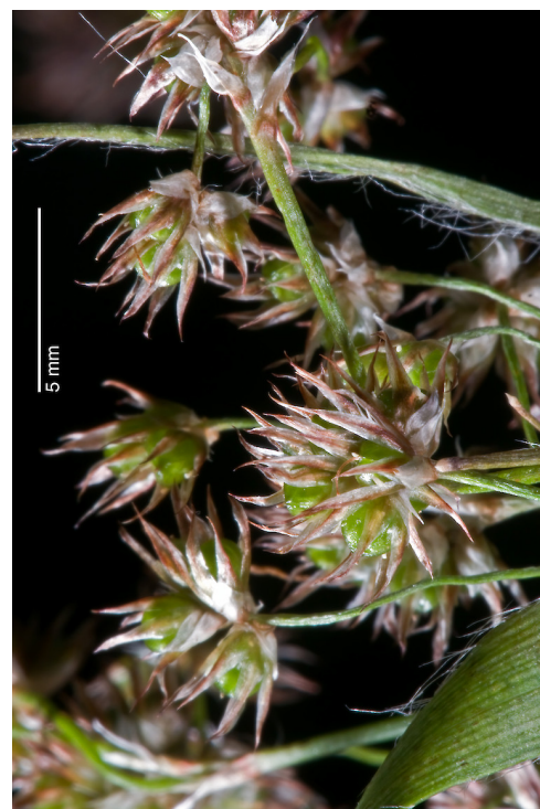
Lake Kohangatera, Wellington.