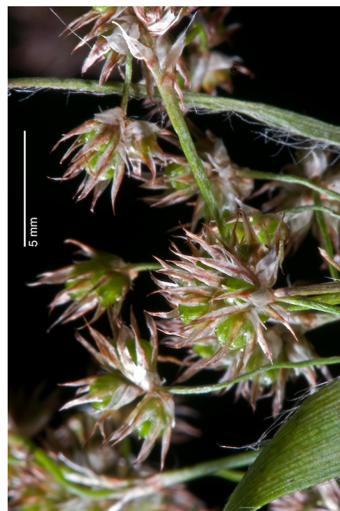
Lake Kohangatera, Wellington.