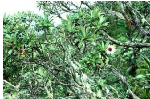
Rangaika, Chatham islands.