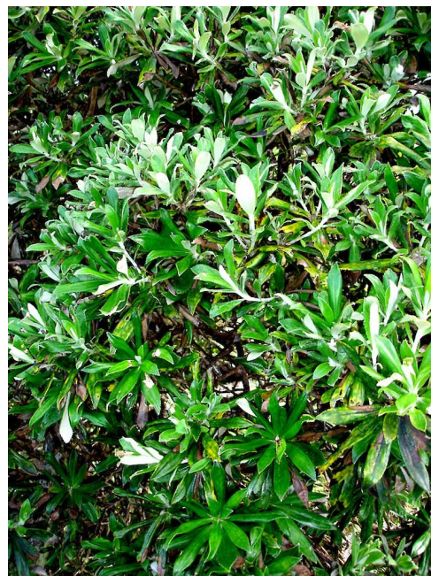
Olearia chathamica.