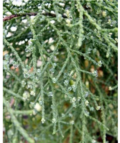
Nov 2006.