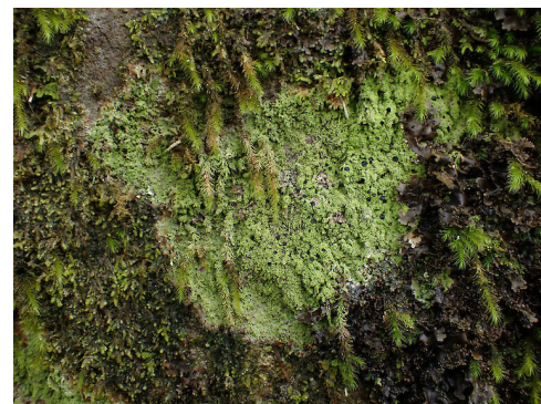
Corticolous in coastal broadleaf forest, Bream Head Whangārei.