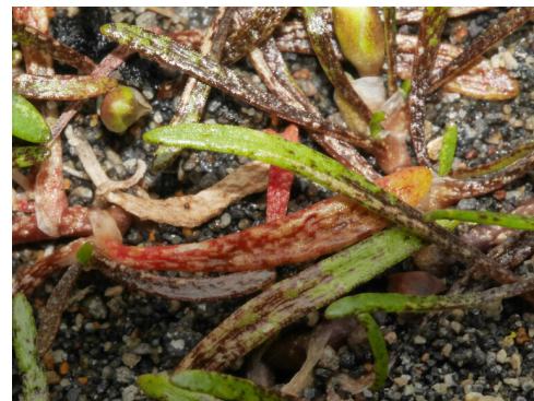
Desert Road, North Island. Photographer: Matt Ward, Date taken: 28/11/2021, Licence: CC BY-NC.