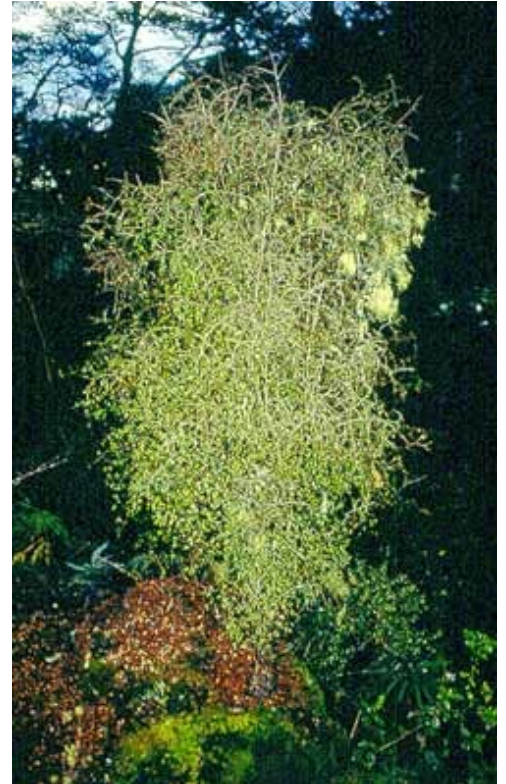
Mt Ruapehu, September.