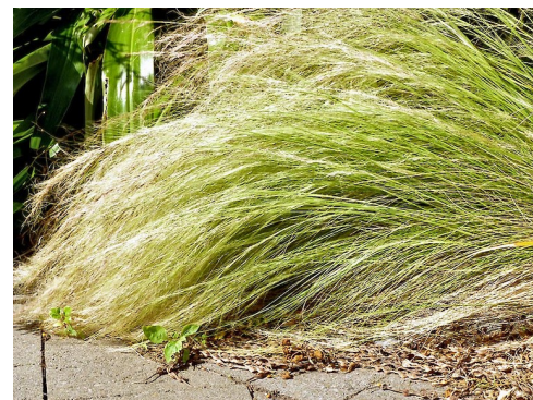
In cultivation, Whanganui. Nov 2011. Photographer: Colin C. Ogle, Licence: CC BY-NC.