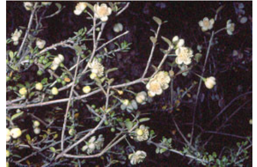
Grebe valley, Fiordland, January.