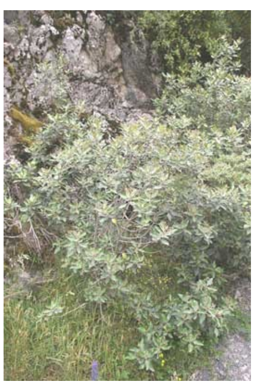
Olearia avicenniifolia.