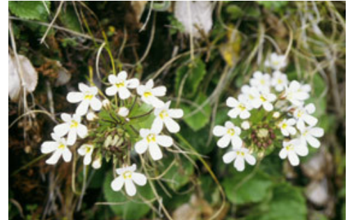
Ourisia.