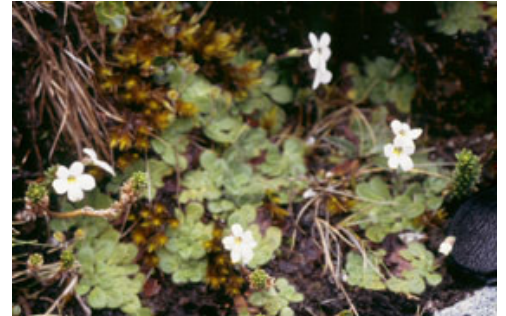
Ourisia.