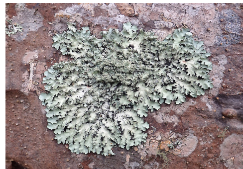
Photographer: Peter J de Lange, Licence: CC BY-NC.