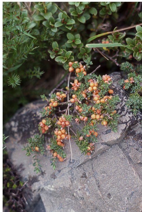
Aoraki/Mount Cook National Park. February 1977.