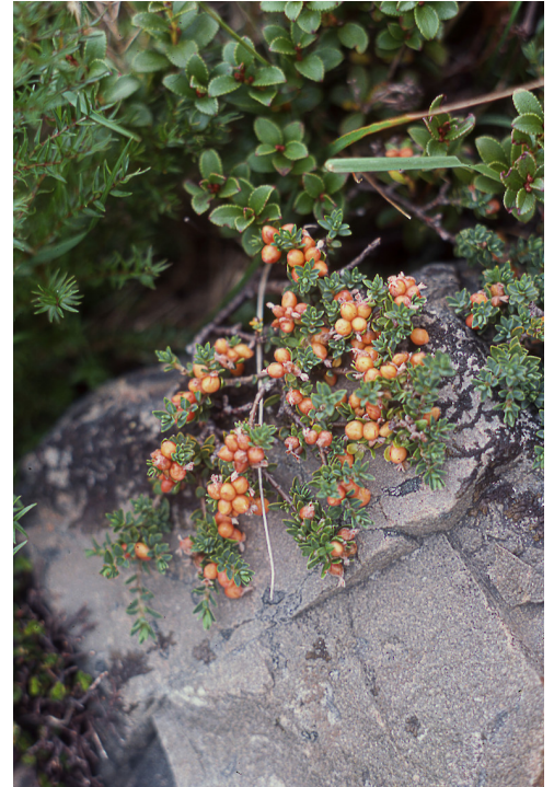
Aoraki/Mount Cook National Park. February 1977.