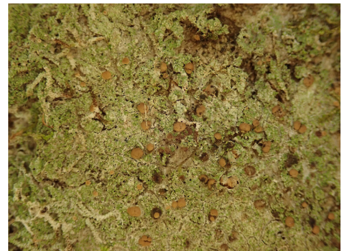
On tree privet in the Waikatō. Date taken: 23/02/2022, Licence: CC BY-NC.