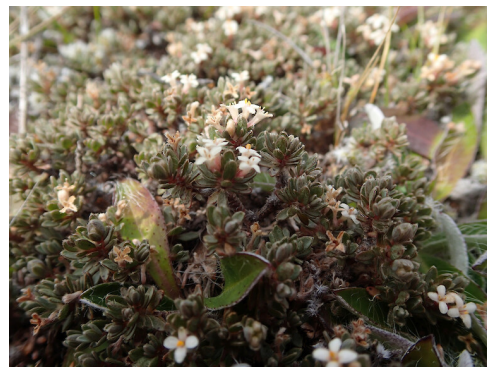
Heron Basin. Photographer: Jane Gosden, Date taken: 10/01/2020, Licence: CC BY-NC.