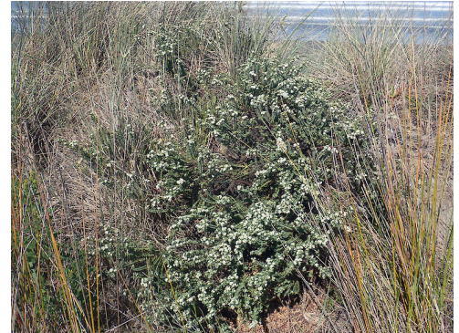
Adult plant, Mahia area.