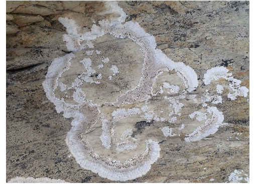
On limestone, Thousand Acre Plateau, Kahurangi National Park. Photographer: Marley Ford, Licence: CC BY-NC.