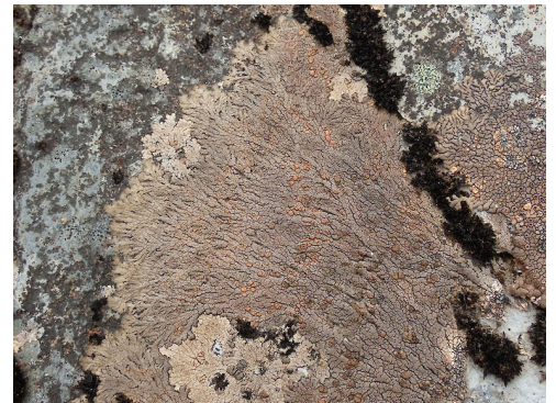
Photographer: Melissa Hutchison, Date taken: 09/10/2022, Licence: CC BY-NC.