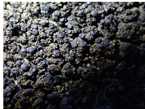
Saxicolous on concrete post, Queenstown Otago. Date taken: 06/12/2022, Licence: CC BY.