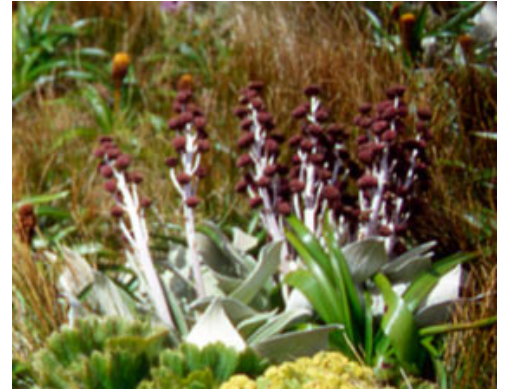
Pleurophyllum criniferum . Photographer: Vivienne McGlynn, Licence: CC BY-NC.