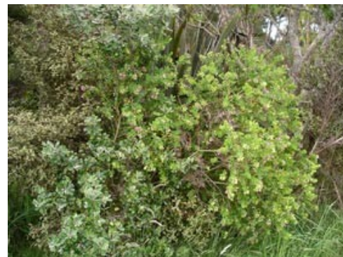
Polygala myrtifolia.