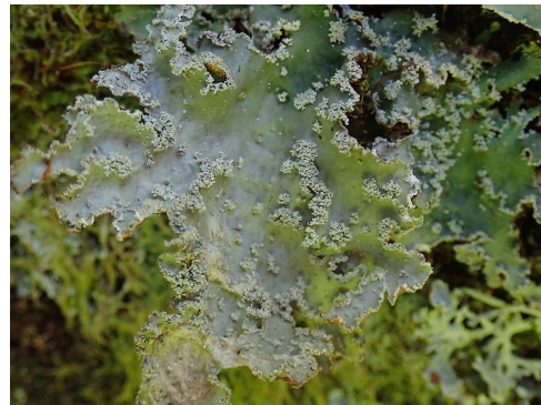
Banks Peninsula. Photographer: Melissa Hutchison, Date taken: 12/11/2019, Licence: CC BY-NC.