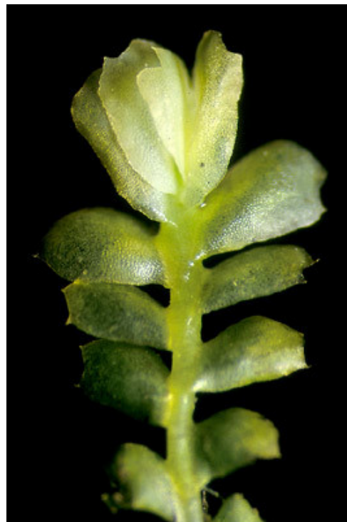
Pseudolophocolea denticulata. Photographer: Bill Malcolm, Licence: All rights reserved.