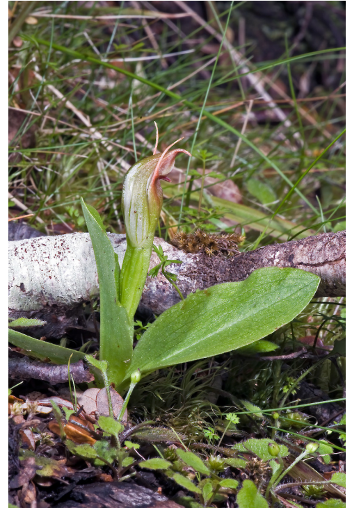
Mount Ruapehu. Photographer: Jeremy R. Rolfe, Date taken: 27/12/2008, Licence: CC BY.