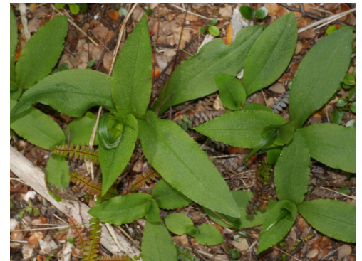
Basal leaves of immature plants. Bealey, Arthur's Pass S.I. Photographer: Matt Ward, Date taken: 13/11/2017, Licence: CC BY-NC.