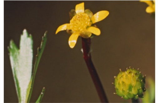
Flower, Taupo Swamp. Plimmerton.