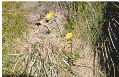
Mt Robert Basin. January.