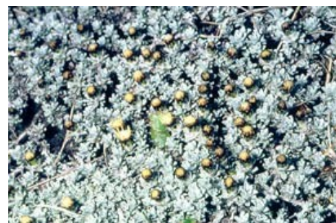
Mt Arthur, February.