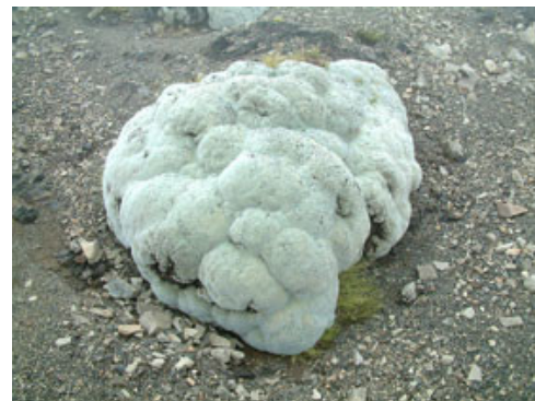
Foggy peak, Torlesse range. January.