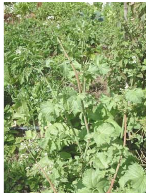
Raphanus sativus.