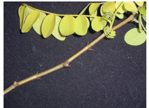
Robinia pseudacacia.