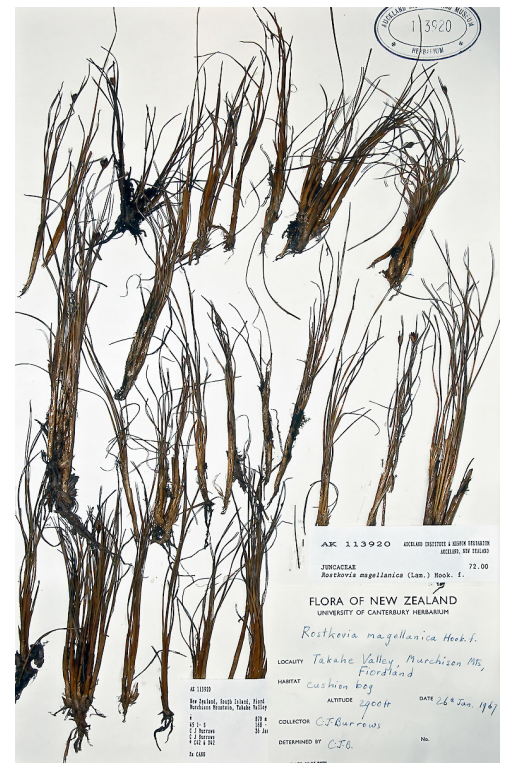
Herbarium specimen: AK 113920. Photographed with permission of Auckland Institute and Museum. Date