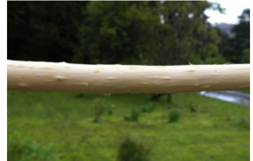
Salix x reichardtii.