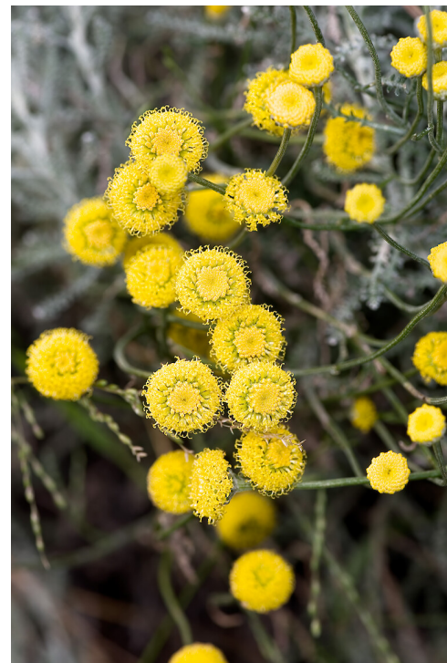
Seaview, Lower Hutt. (?planted). Date taken: 09/12/2006, Licence: CC BY.