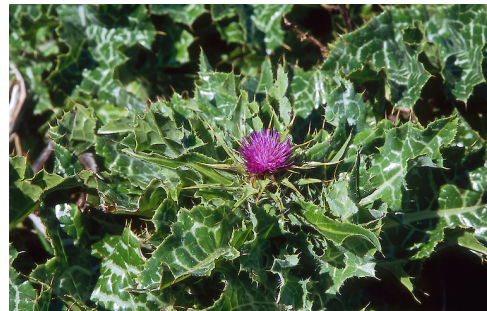
Turakirae Head.