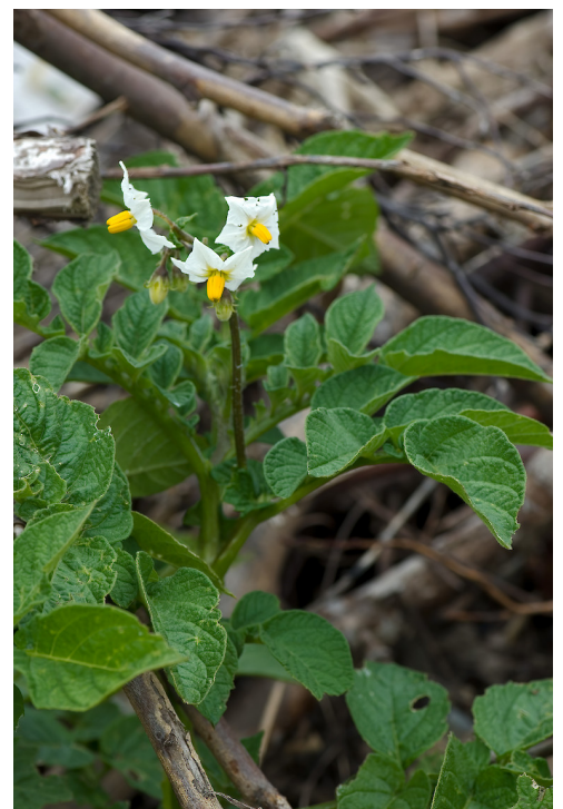
Garden discard. Silverstream, Upper Hutt.