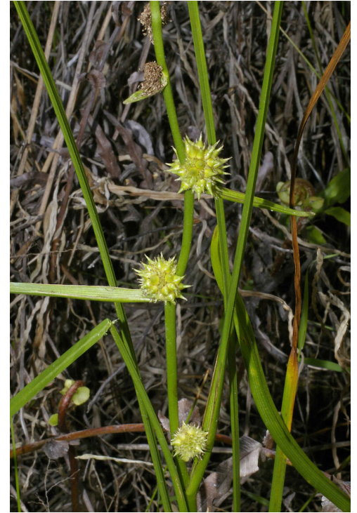
Sparganium subglobosum.