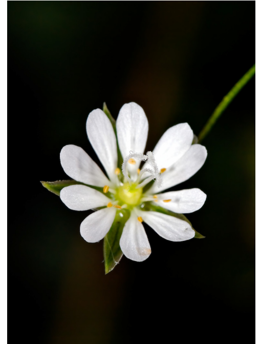
Flower showing divided petals, 3 styles, 10 stamens. Stokes Valley, Lower Hutt.