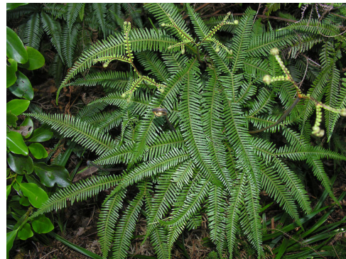
Onekaka ex Rangihaeata Oct 13. Photographer: Simon Walls, Date taken: 01/10/2013, Licence: CC BY-NC.